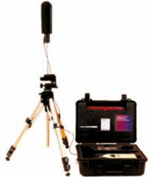
CK:508 Lightweight Outdoor Measurement Kit shown with optional CT:3 Tripod

Both of these kits provide a secure, weatherproof enclosure for the Sound Level Meter and an Outdoor Microphone.