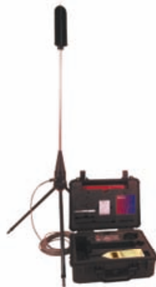
CK:408 Heavy Duty Outdoor Measurement Kit

For full details of the Outdoor Measurement Kits, please see the appropriate datasheet. Please note that Type 2 versions of the CR:800B require the MO:800/5 Remote Preamp option before they can be used with the Outdoor Measurement Kits.